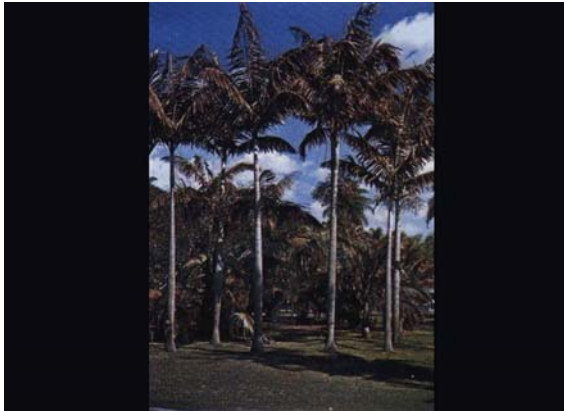
Figure 1. Severe cold damage.

Cold weather slows down the growth of palms, reduces the activity of the roots, and often weakens the plant to the point where a disease can become active and kill the palm. Severe cold damage from frost or freezing temperatures destroy plant tissues and may severely reduce water conduction in the trunk for years. Often the only above-ground portion of a cold-damaged palm that is still alive is the protected bud. As warmer weather returns, primary or secondary plant pathogens often attack weakened plants through damaged tissue.