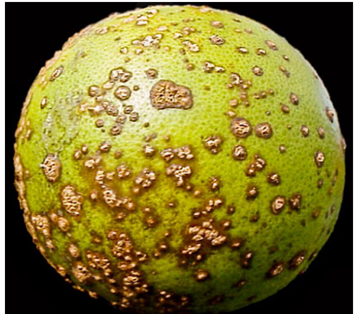
Figure 5. Raised, brown canker lesions on fruit with particularly prominent water soaked margins.

Further information about citrus canker can be found at http://www.crec.ifas.ufl.edu/extension/canker/ and http://www.freshfromflorida.com/pi/canker/ .