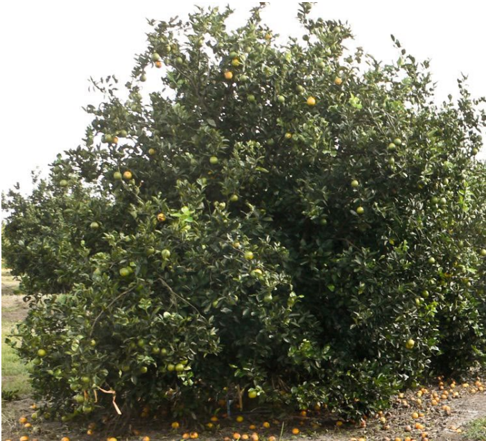
Figure 7. Fruit drop caused by citrus canker on a 'Hamlin' sweet orange tree.