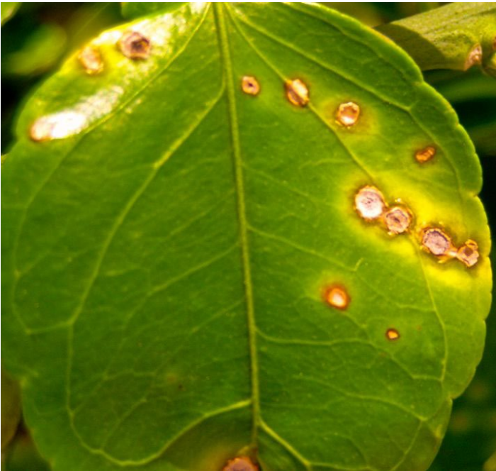
Figure 6. Raised, brown canker lesions on leaf.