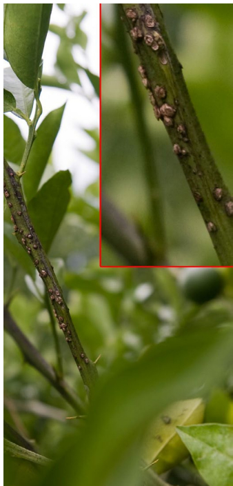
Figure 3. Twig lesions with an inset of some blister-like lesions at a higher magnification.