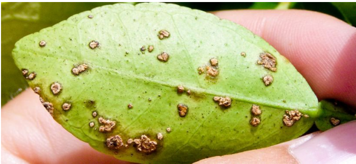
Figure 2. Round, raised blister-like lesions with water-soaked margins.

attempted third eradication of the disease, the hurricanes of 2004-2005 spread the disease from 10 counties to 25 where the disease is present today. During the initial eradication process, 2.1 million commercial and dooryard trees were destroyed by 2003. In January 2006, the eradication program ended because the disease became so widespread that it was no longer feasible to continue the eradication efforts. As a result, the citrus industry is now learning to live with and manage citrus canker while continuing to produce quality fruit.